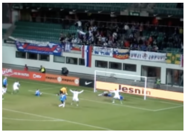
Estonia lost 0:1 against Slovenia through an own goal.

This suggested change may turn out to be quite a spectacular own goal.