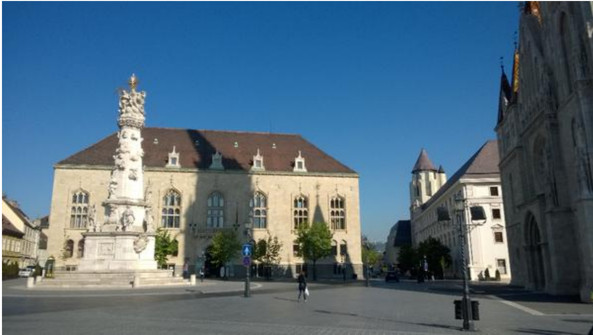
the UPC's training centre in Budapest

Potential UPC candidates could submit an expression of interest until 15 November 2013. There were 360 expressions of interest to become a legal judge, of which 124 were qualified as “outstanding”. There will be a further selection process and the current plan is that 80 legal judges and 40 technical judges will be trained in 2015 (according to a presentation by Kevin Mooney at the last EPLAW Congress). This actually means that those will be the judges that will be appointed when the UPC starts.