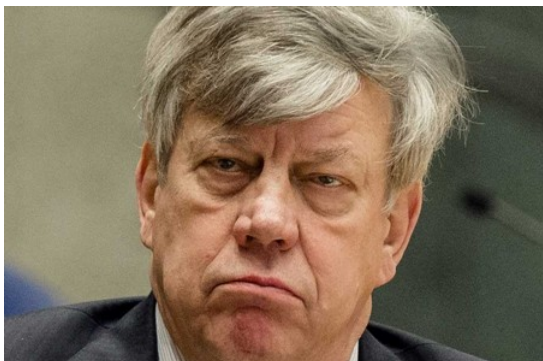
Minister Ivo Opstelten resigned