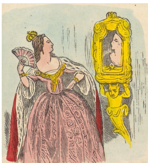
‘Laminated jealous glass’

The Czech language, unlike the English language, belongs among the so-called flexible language types and has a number of irregularities and exceptions. Flexible languages typically accumulate meanings in a single morpheme which is able to express, at the same time, multiple functions, such as case, number and gender. Let’s have a look at the adjective “good“, for example. In English, a woman, a man, a child or a machine is always “good“, whether in the singular or in the plural, in the nominative, genitive or dative. It is different in Czech. A woman is “dobrá“, a man is “dobrý“, a child is “dobré“. And that’s just the singular nominative. (...) Another problem is posed by nouns and their case endings (there are seven cases in the Czech language), in which functions are accumulated again (...). While declining, there often occurs a change of stem vowels. Not only nouns but also adjectives, pronouns and numerals are declined, thus having various forms. Word order is free which, (...) causes the language to be highly sensitive to functional sentence perspective. And this is just an outline of some problems (...).’