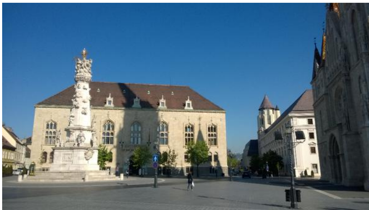
the UPC's training centre in Budapest

First Instance, due to the casting vote of the chairman in case an additional technical judge is appointed, we may actually already have a pretty good picture.